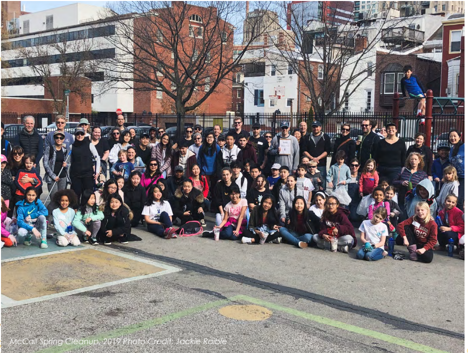
McCall Spring Cleanup, 2019